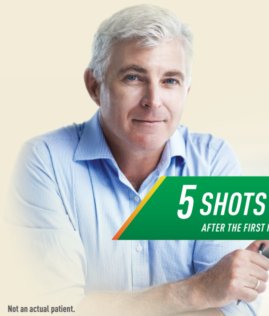
Not an actual patient.

5 SHOTS A YEAR AFTER THE FIRST MONTH OF THERAPY